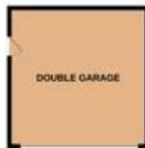
TOTAL FLOOR AREA: 2079 sq ft (193.2 sq m) approx.

Whilst every attempt has been made to ensure the accuracy of the floorplan contained here, measurements of doors, windows, rooms and any other items are approximate and no responsibility is taken for any error, omission or mis-statement. This plan is for illustrative purposes only and should be used as such by any prospective purchaser. The services, systems and appliances shown have not been tested and no guarantee as to their operability or efficiency can be given. Made with Metriplex ©2025